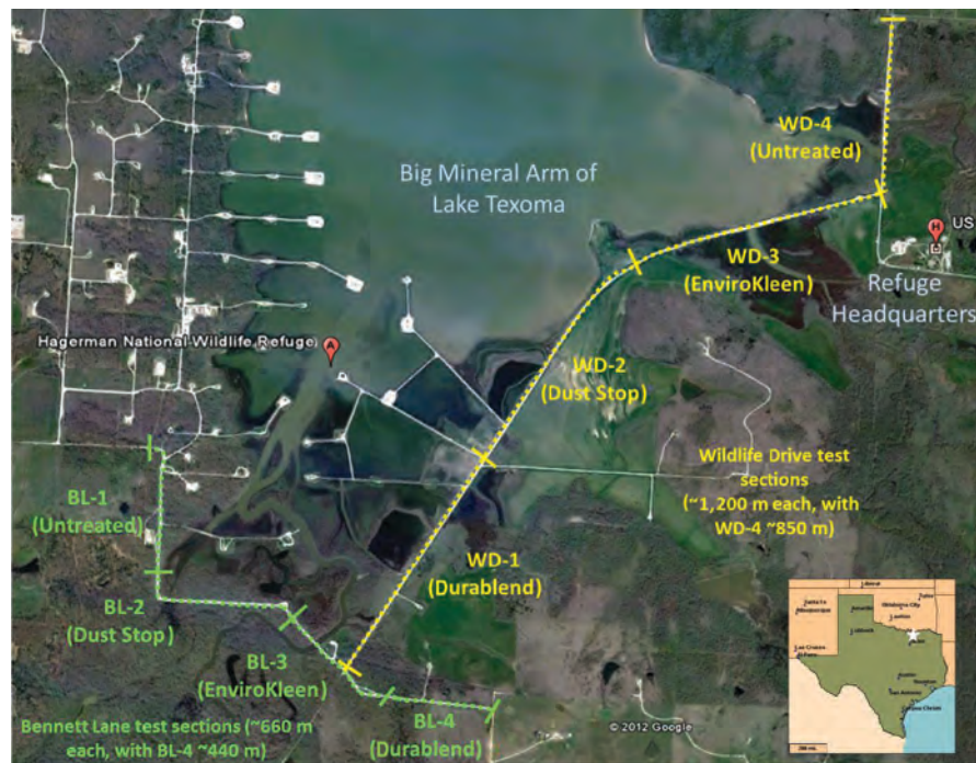
FIGURE 1 Test section layout and lengths at Hagerman NWR (WD = Wildlife Drive; BL = Bennett Lane).

Dust Stop was shipped to the refuge as a pallet of 11.34-kg bags (1,134 kg total). Dust Stop was applied in two phases: initial mix-in and topical applications with a water truck and a topical application with a hydroseeder 2 weeks later. Initial applications were planned at 0.45 kg/5.1 m 2 applied as multiple passes with a dilute solution of Dust Stop mixed into the top 5 cm of road surface, followed