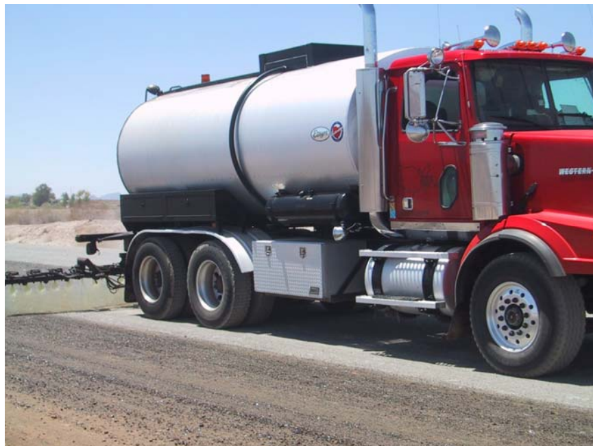
Figure 4. Application of EnviroKleen product at MC