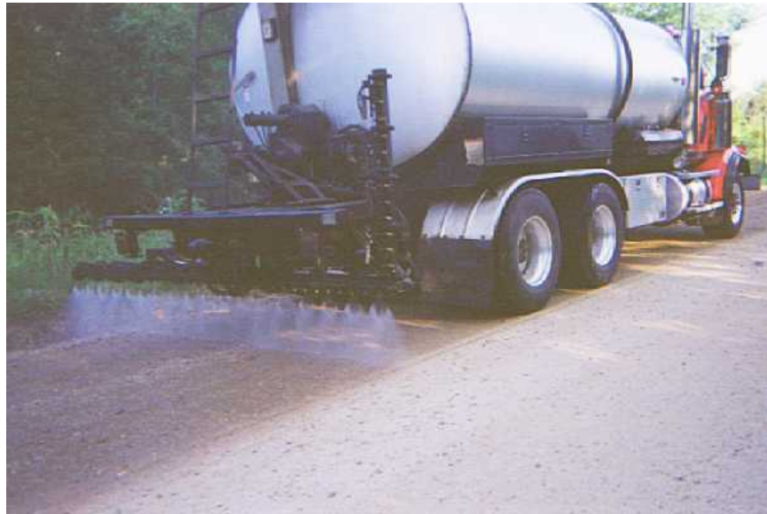
Figure 3. Application of EnviroKleen product at FLW