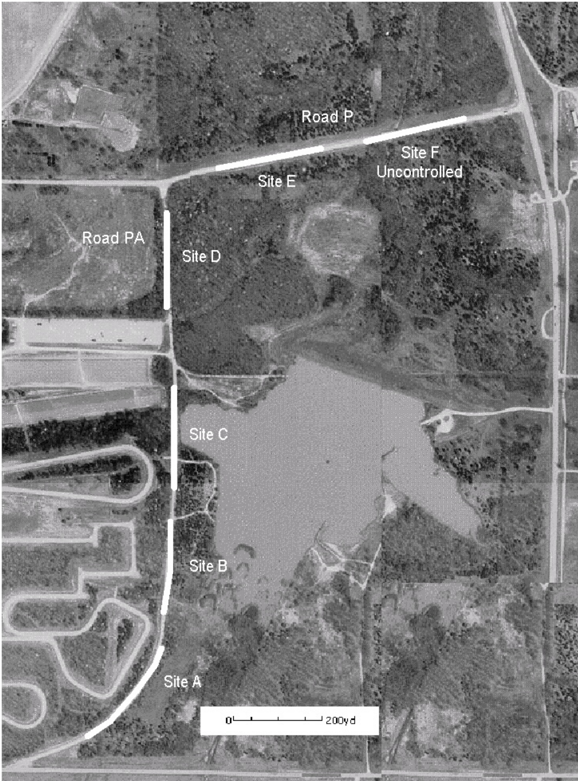
Figure 1. Test locations at FLW